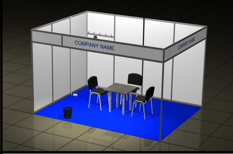
PENINSULAR STAND 12 sqm